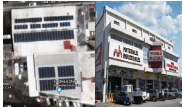
A rooftop view of the 132.4kW PV system with 420 retrofitted modules in Dominican Republic.

Location: Santo Domingo, Dominican Republic System Size: 132.4kW, Commercial Tigo Products: 420 TS4-R-O's (Optimization) Modules: 63 Hyundai 345W (new) 357 Hyundai 310W (original) Inverter: 2 SMA STP 60-US-10 Commissioning: 1 Year before Tigo Retrofit Installer: ENCOS – Caribbean Distributor