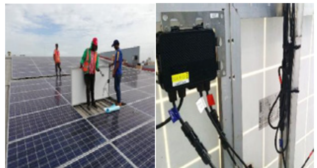
Tigo TS4-R-O units are installed on the back of each module for shade and mismatch mitigation.

First, Materiales wanted a precise string- and module-level monitoring solution because mismatch was evident and only 1 MPPT was available for the 20 strings. Second, 4 strings were shaded for 4 hours a day: 2 hours in the morning and 2 more in the afternoon. Third, the newer 63 345W modules were operating as 310W modules instead of at their peak power.